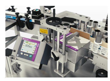
Thermal transfer marker.