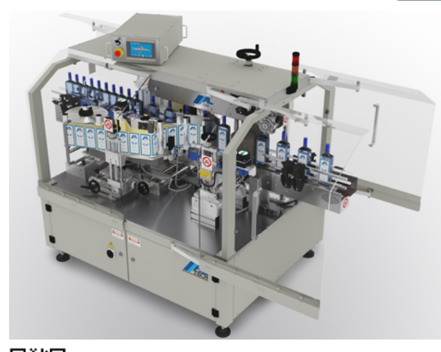
ALline labelling system with protection cabin. (Video)

The ALline series has been developed with the latest ALTECH design criteria, based on years of experience having thousands of machines installed around the world. The result is a series of labellers designed in strict compliance with CE safety regulations, suitable for the heaviest work-loads. The systems provide extremely accurate label placement at high production speeds and feature a superior level of operator friendliness. Changeovers are simple, tool-less and intuitive.