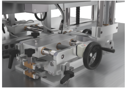
Labelling head support with micrometric adjustment.