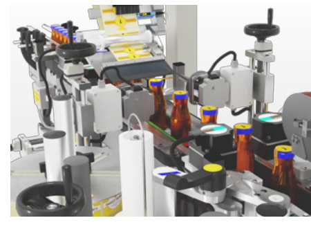
Adapter for seals.